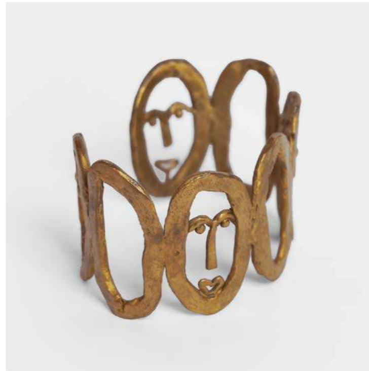
BRACELET LA RONDE Michelle Crouzet - 2025 - H 4,2 W 7,2 D 5 cm Bronze