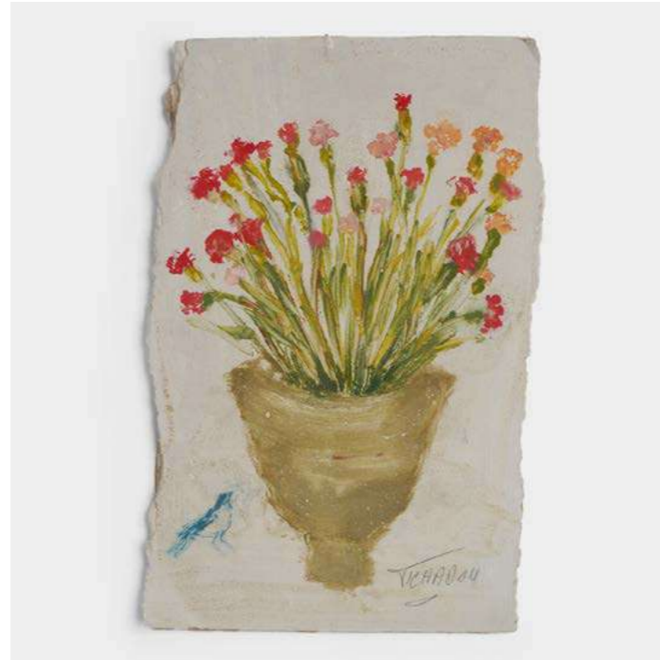
LE BAISER DU MATIN (FLEURS ET OISEAU) Corinne Tichadou - 2025 - H 30,5 W 19,5 D 1,3 cm Oil, acrylic and pastels on plasterboard