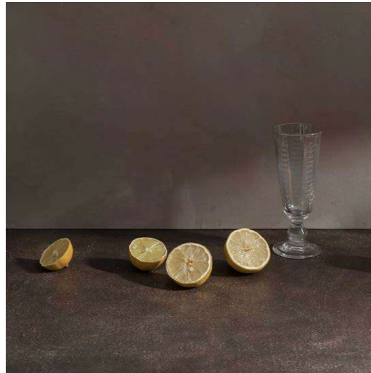
QUATRE CITRONS ET VERRE 1/6 Thierry Genay - 2025 - H 30 W 30 cm Fine art print on matte photo paper, black wooden frame.