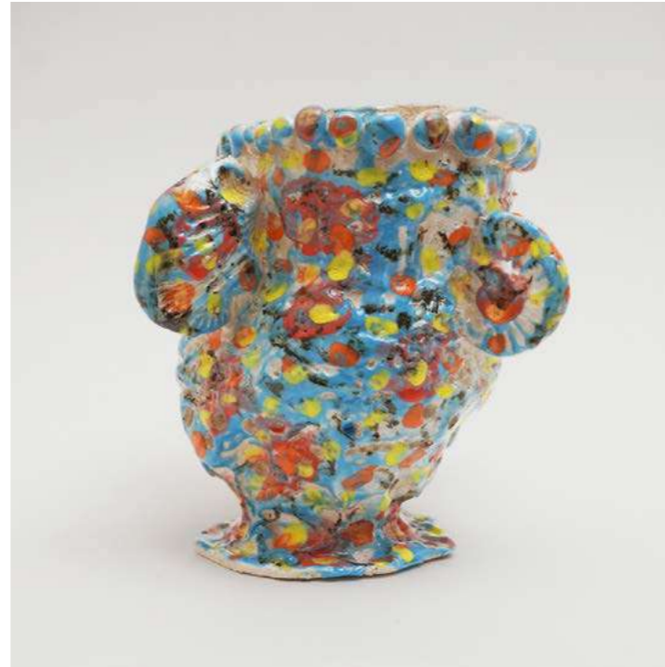
SHELL VASE 7 MULTICOLOR WHITE STONEWARE M Marie-Pierre Biau - 2025 - H 16,5 Ø 18 cm Glazed stoneware decorated with engobes and oxides