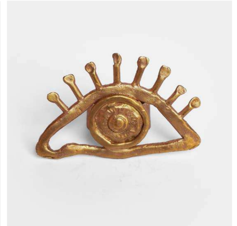
RING L'ŒIL Michelle Crouzet - 2025 - H 3,5 W 5,3 D 2 cm Bronze