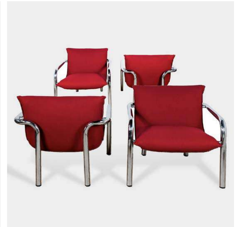
4 ITALIAN ARMCHAIRS IN CHROME AND RED FABRIC Unsigned, Italy - 1970 - H 70 W 70 D 73 cm Chrome frame and cotton fabric