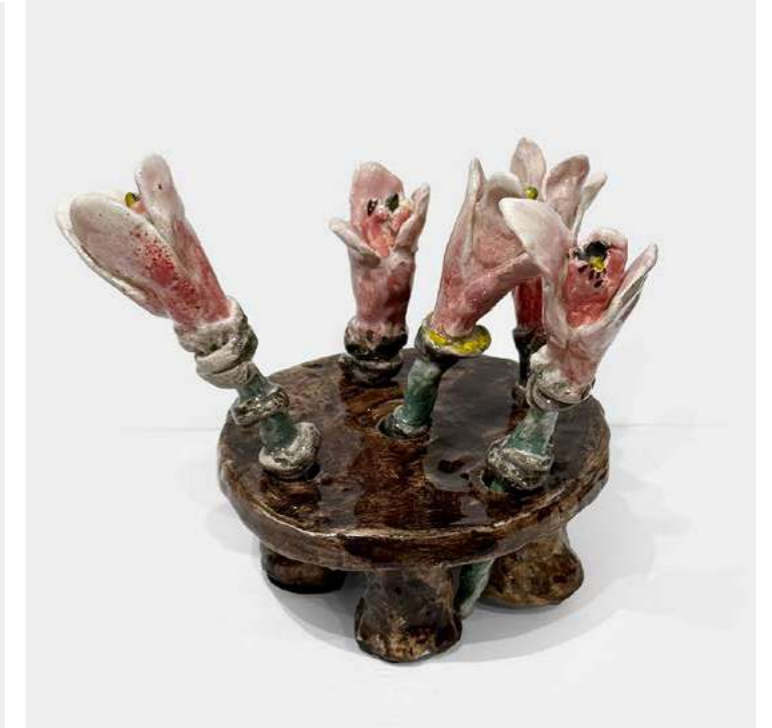
PIQUE FLEURS CERAMIQUE Sylvie Peyneau - 2024 - H 17 W 13 D 13 cm Polychrome glazed ceramic