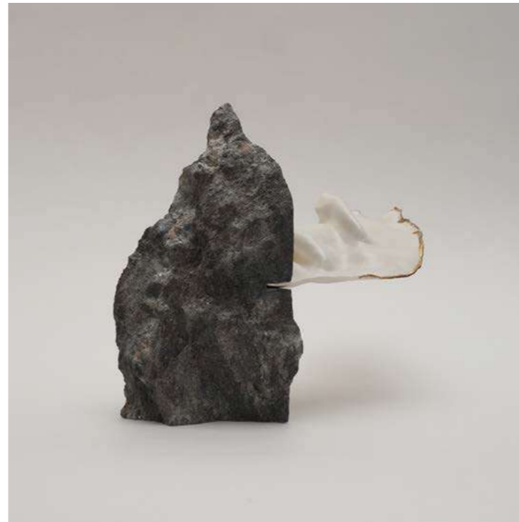
PICCOLO IMAGO III D.Stanczel & T. Scaciga - 2025 - H 15 W 24 D 10 cm Porcelain, gold leaf and black silver Eclisseo granite