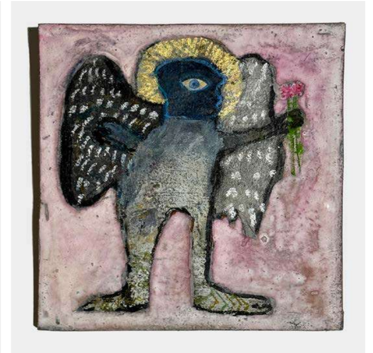
L'ANGE OISEAU Corinne Tichadou - 2025 - H 25 W 25 D 2 cm Oil and pastels on paper mounted on wood