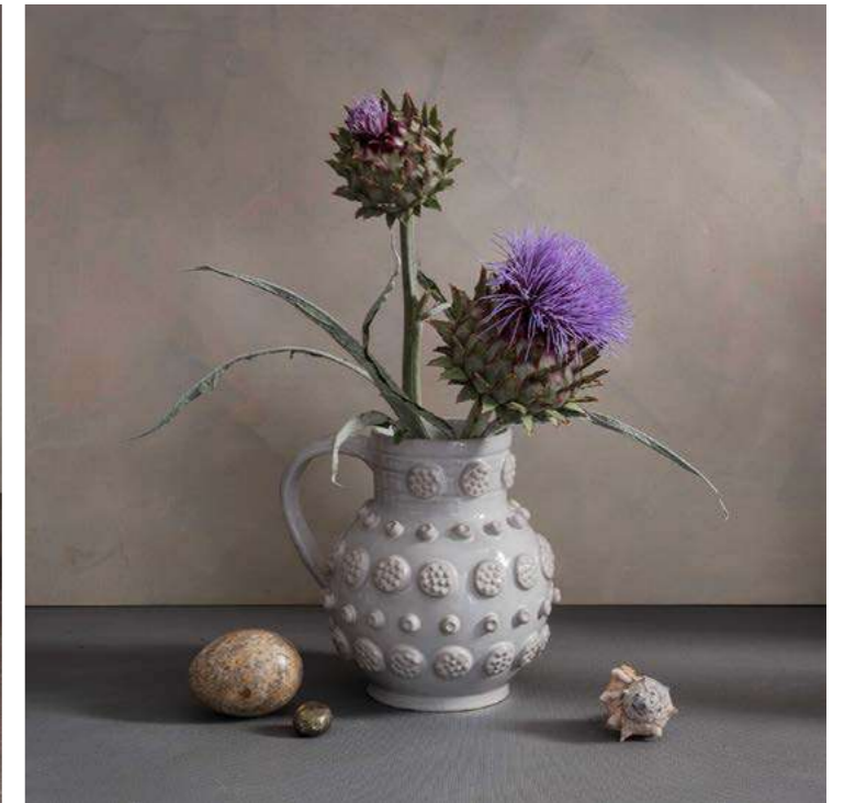
CARDUUS, OEUF, PYRITE ET COQUILLAGE 1/6 Thierry Genay - 2025 - H 30 W 30 cm Fine art print on matte photo paper, black wooden frame.