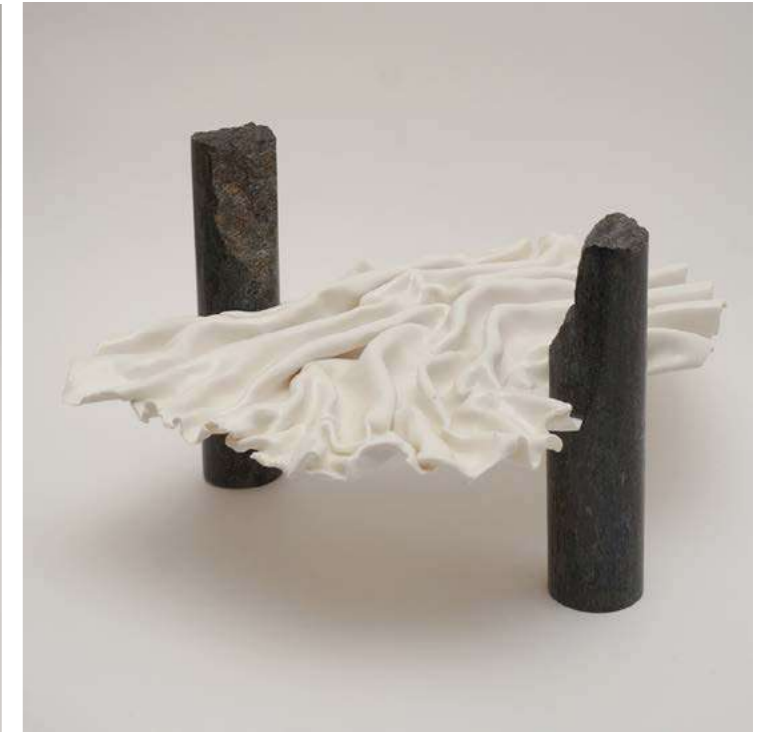
OCEANINE D.Stanczel & T. Scaciga - 2019 - H 25 W 34 D 40 cm Porcelain and black silver Eclisseo granite