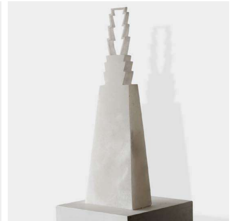
BAAL F.X. Poulaillon - 2025 - H 60,5 W 20 D 10 cm Alabaster