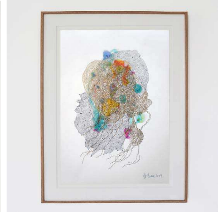
UNTITLED 29,7 x 21 Marie-Pierre Biau - 2019 - H 44 W 35 D 3 cm Inks and markers on paper