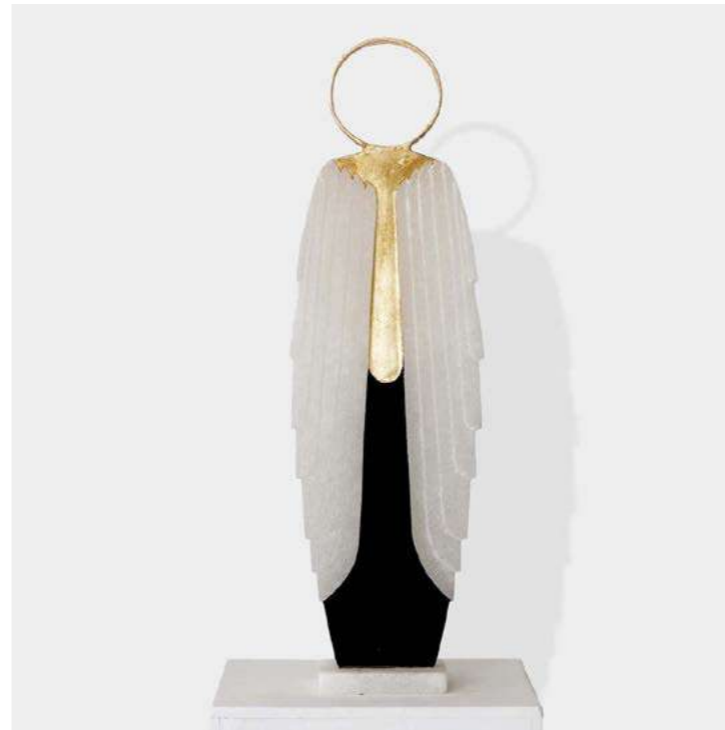
EN NOUS LE PHENIX F.X. Poulaillon - 2025 - H 62 W 18,5 D 10 cm Alabaster, ink and gold leaf