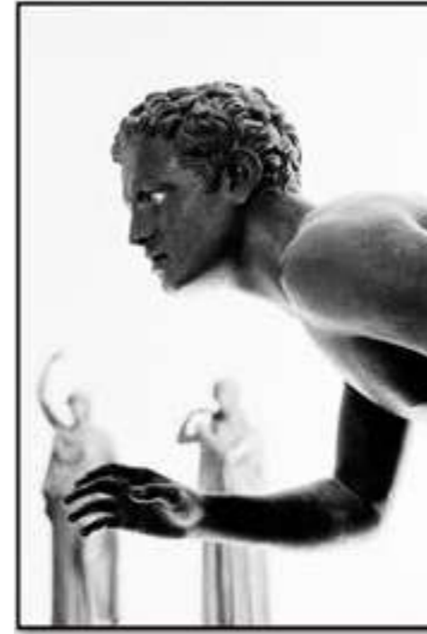
BRONZE D'HERCULANUM, NAPLES (12/21) 1992 - H 90 W 60 cm Pigment print on baryta paper and Dibond