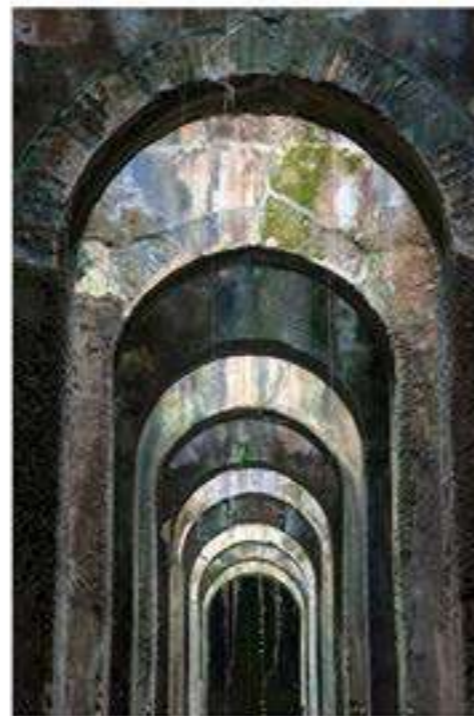
PISCINA MIRABILIS, CAP MISÈNE, ITALIE 2010 - H 140 W 93 cm Color print on Hahnemühle Baryta pearlescent paper mounted on Dibond.