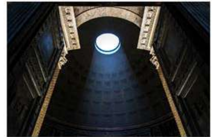
PANTHEON, ROME, ITALIE (1/12) 2020 - H 93 W 140 cm Color print on Hahnemühle Baryta pearlescent paper mounted on Dibond.