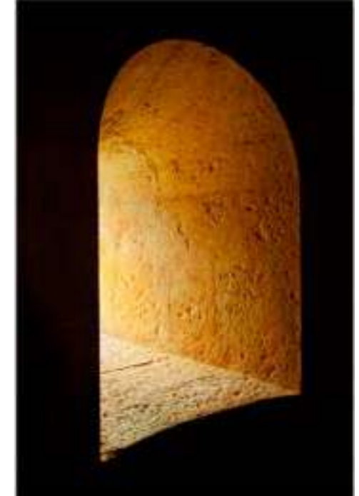
ABBAYE DU THORONET, FRANCE (1/12) 2012 - H 110 W 75 cm Color print on pearlescent fine art paper mounted on Dibond