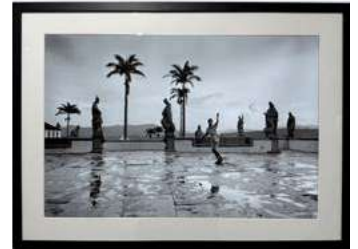
TERRASSE DES PROPHÈTES, BRÉSIL (1/1) 1991 - H 39 W 59 cm (encadrement 53 x 73 cm) Digital print on premium glossy paper (MEP)