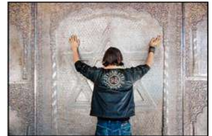
TEMPLE HINDOU, HIMALAYA (10/21) 2011 - H 93 W 140 cm Pigment print on baryta paper and Dibond