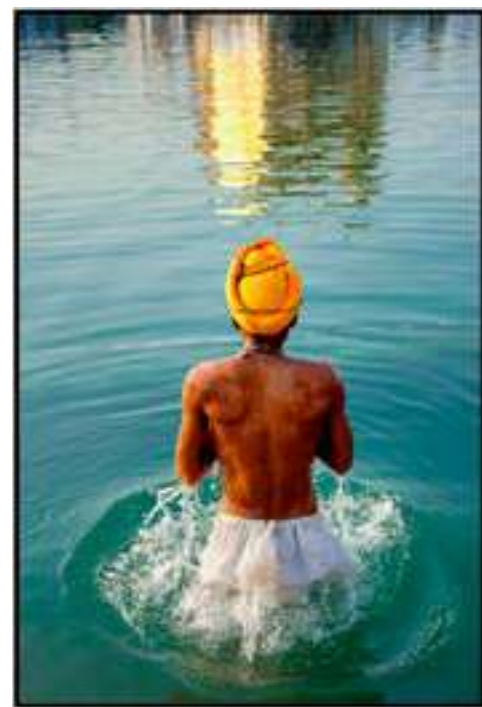
TEMPLE D'OR D'AMRITSAR, INDE (2/12) 2011 - H 90 W 60 cm Pigment print on baryta paper and Dibond