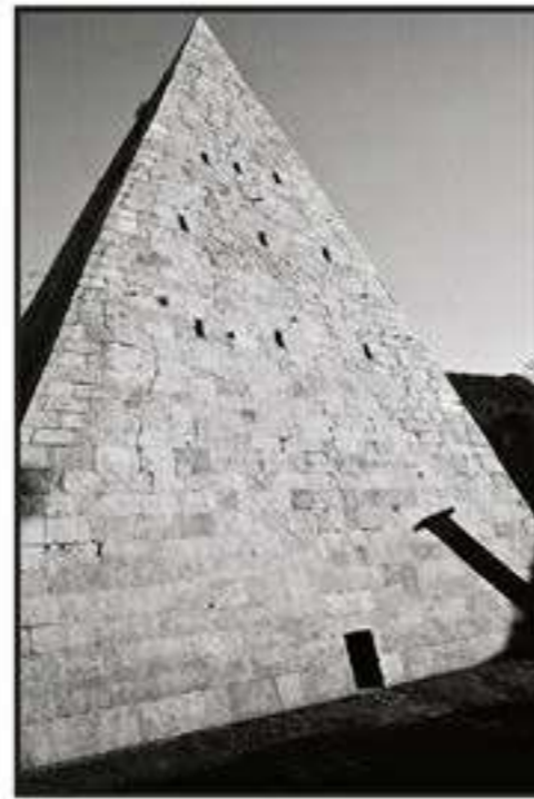
PYRAMIDE DE CAIUS CESTIUS, ROME (1/21) 2007 - H 110 W 75 cm Color print on pearlescent fine art paper mounted on Dibond