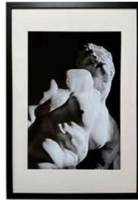
MILON DE CROTONE PAR PIERRE PUGET, PARIS (1/1) 1988 - H 45 W 30 cm (encadrement 63 x 43 cm) Digital print on premium glossy paper (MEP)