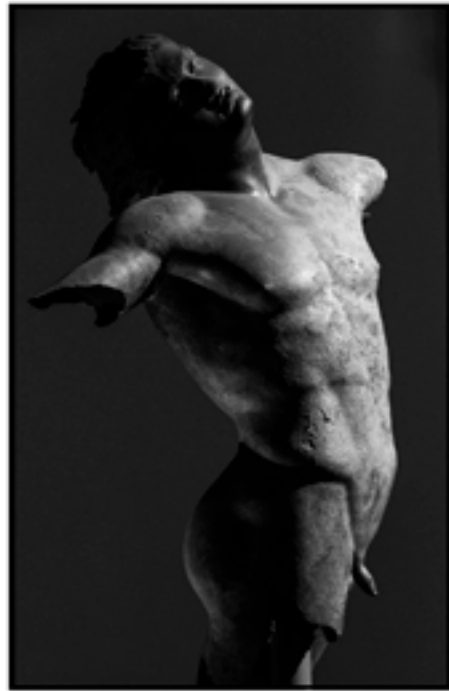
FAUNE DANSANT, MAZZARA DEL VALLO (1/12) 2019 - H 110 W 75 cm Pigment print on baryta paper and Dibond