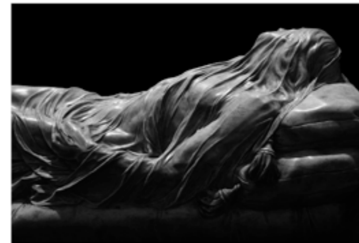
CRISTO VELATO, SANSEVERO, NAPLES 1/12 1994 - H 100 W 140 cm Pigment print on baryta paper and Dibond