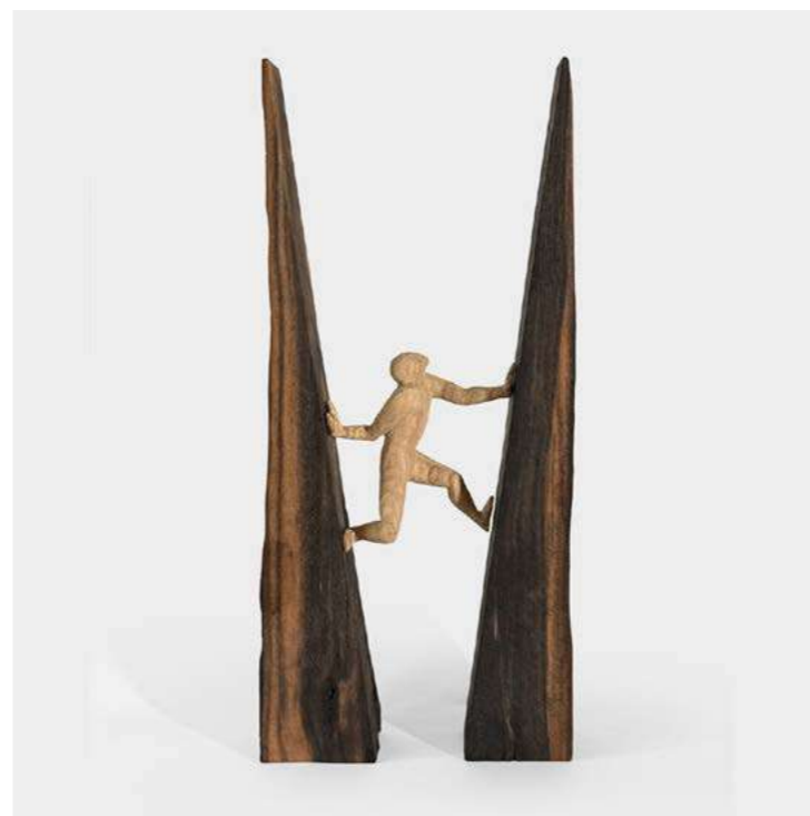
LA LIMITE Gibus - P.U. 2023 - H 57 W 26 D 6 cm Sculpture in apple wood and ebony.