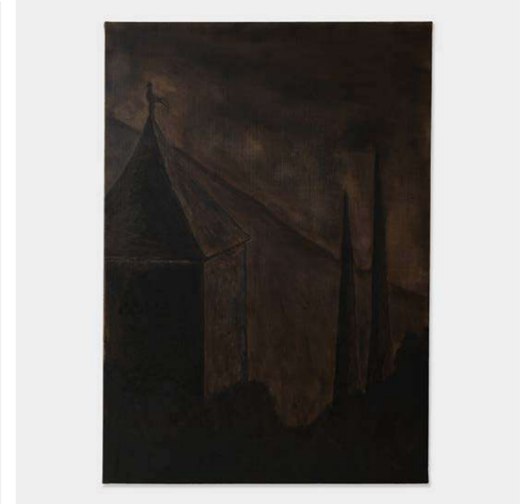
LE PIGEONNIER – PÉRÉGRINATION Remy Allamand - 2025 - H 92 W 65 D 3 cm Inks, walnut stain and acrylic paint