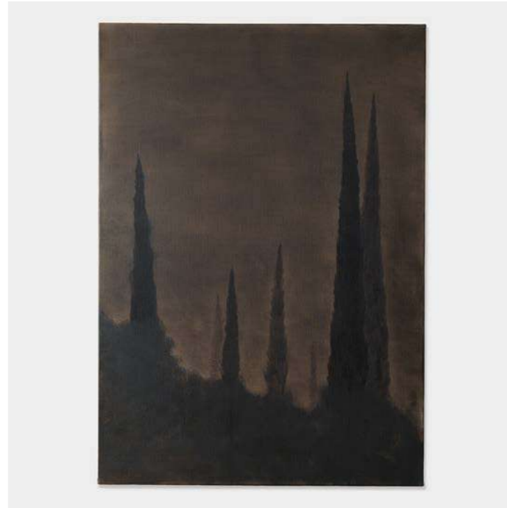
CYPRES II – PÉRÉGRINATION Remy Allamand - 2025 - H 92 W 65 D 3 cm Inks, walnut stain and acrylic paint