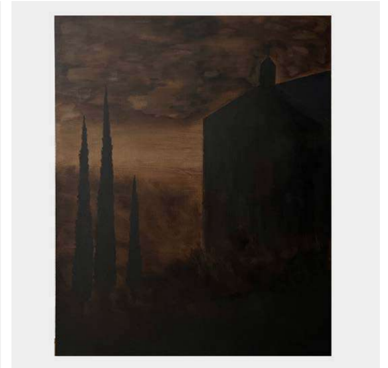
LA CHAPELLE – PÉRÉGRINATION Remy Allamand - 2025 - H 116 W 95 D 3 cm Inks, walnut stain and acrylic paint