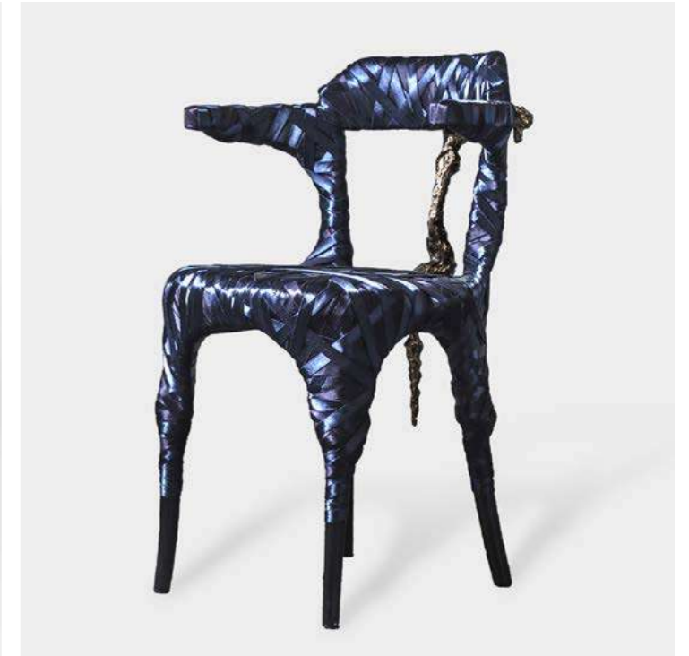
IN MEMORIA William Guillon - P.U. 2024 - H 78 W 115 D 115 cm Chaise revêtue de satin et bronze original patiné.