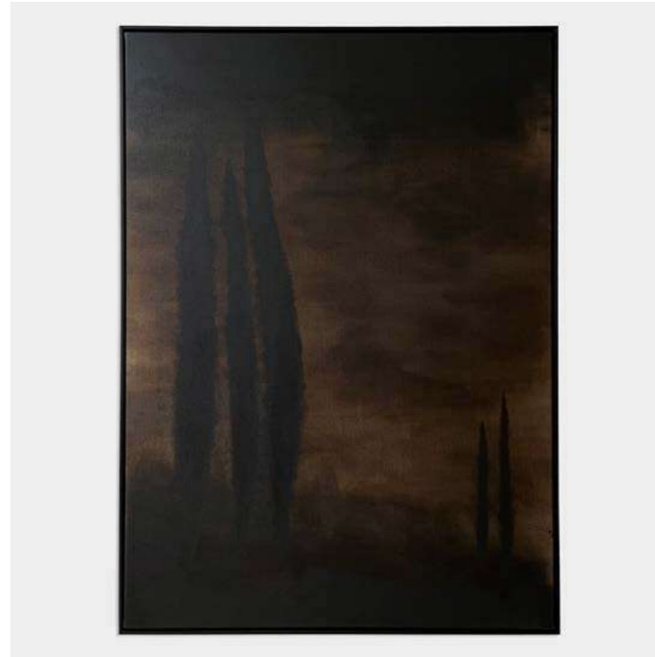
CYPRES I – PÉRÉGRINATION Remy Allamand - 2025 - H 185 W 135 D 3 cm Inks, walnut stain and acrylic paint