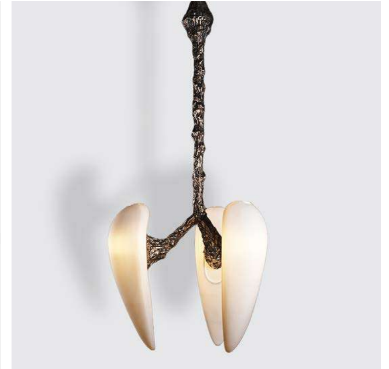
LV 426 BALANCED William Guillon - P.U. 2022 - H 135 W 80 D 80 cm Suspension en bronze patiné et porcelaine.