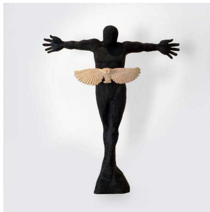
CATHARSIS Gibus - P.U. 2023 - H 30 W 26 D 8 cm Sculpture in pine and burnt maple wood.