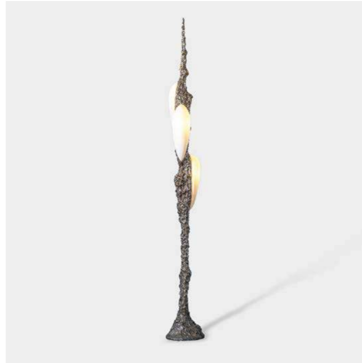
LV 426 FLOORLAMP William Guillon - P.U. 2024 - H 225 W 30 D 30 cm Lampadaire en bronze patiné et porcelaine.