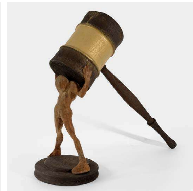
LA CULPABILITÉ Gibus - P.U. 2025 - H 26 W 24 D 10 cm Cedar wood sculpture.